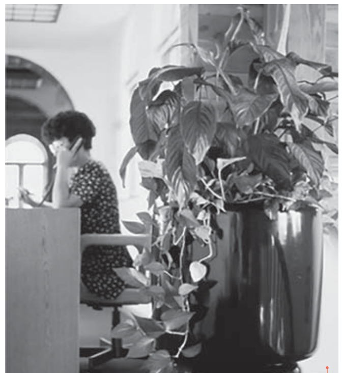
Prototype unit used in the Mission Control building of the Biosphere 2 project.